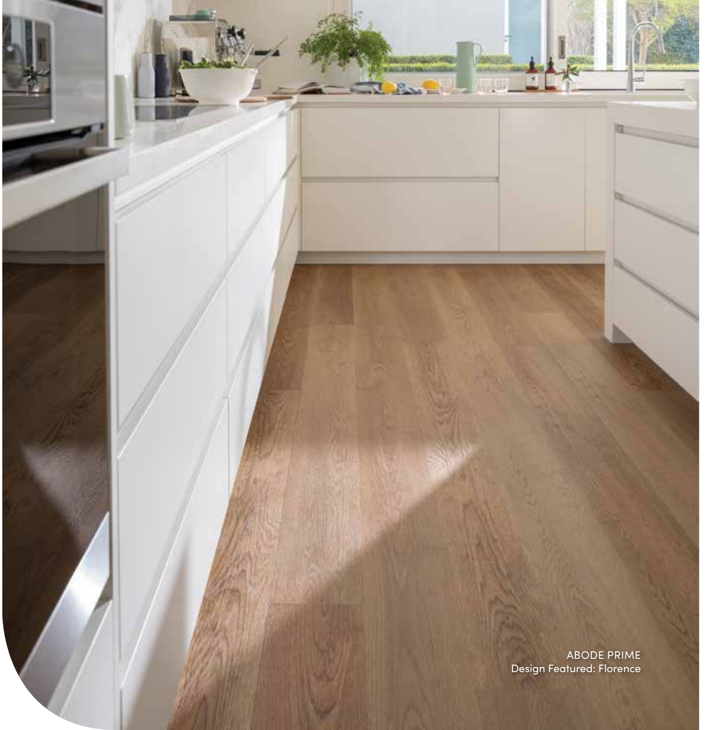
ABODE PRIME Design Featured: Florence