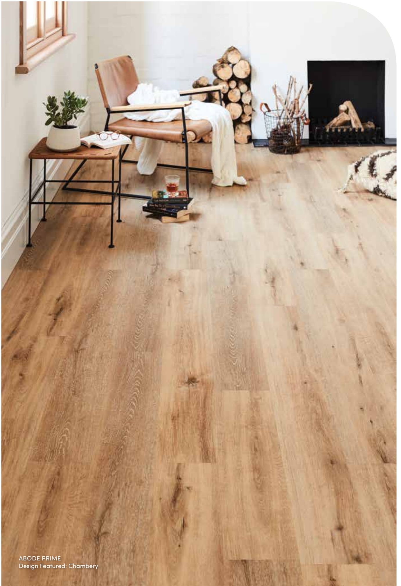
ABODE PRIME Design Featured: Chambery